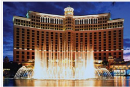
Bellagio, photo courtesy MGM Resorts International

Since Vegas Uncork'd kicks off at Caesars Palace, make it easy on yourself and book a room at The Laurel Collection by Caesars Palace . This Forbes Travel Guide Four-Star hotel includes the Augustus and Octavius towers, a private valet entrance, elegant décor and direct access to the Five-Star Restaurant Guy Savoy .