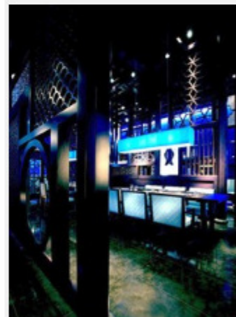
Hakkasan Las Vegas, photo courtesy MGM Grand Las Vegas

If you scored a ticket to the sold-out Vegas Uncork'd Kickoff Party at the newly opened Hakkasan Las Vegas inside MGM Grand on Thursday, you'll be treated to Cantonese creations from chef Ho Chee Boon. You'll also be able to explore all five levels of the 80,000-square-foot nightclub outfitted with LED screens, an Asian-inspired garden, sizable VIP booths, dance floors, an exclusive mezzanine area and more. $150, May 9, 9 p.m., Hakkasan Las Vegas at MGM Grand.